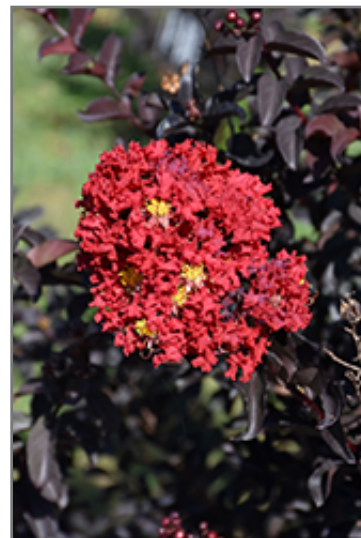
Delta Flame Crapemyrtle flowers