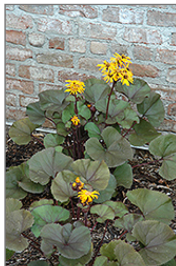
Rayflower in bloom