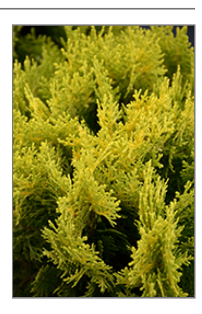
Lime Delight Arborvitae foliage