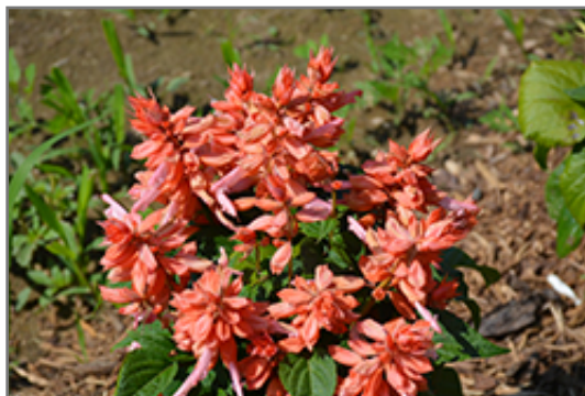
Vista Salmon Sage flowers

Vista Salmon Sage is recommended for the following landscape applications;