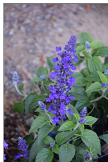
Mysty Salvia flowers