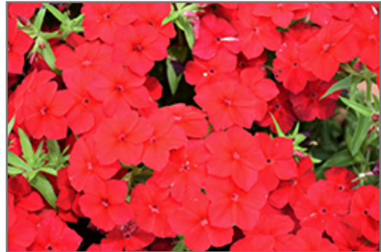
Phloxstar Red Annual Phlox flowers