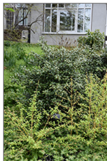
Cherry Bomb Winterberry Holly