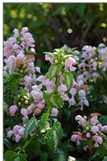
Shell Pink Spotted Dead Nettle flowers