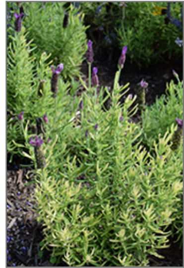
Javelin Forte Deep Purple Lavender in bloom

Javelin Forte Deep Purple Lavender is a fine choice for the garden, but it is also a good selection for planting in outdoor pots and containers. It is often used as a 'filler' in the 'spiller-thriller-filler' container combination, providing a mass of flowers and foliage against which the thriller plants stand out. Note that when growing plants in outdoor containers and baskets, they may require more frequent waterings than they would in the yard or garden.