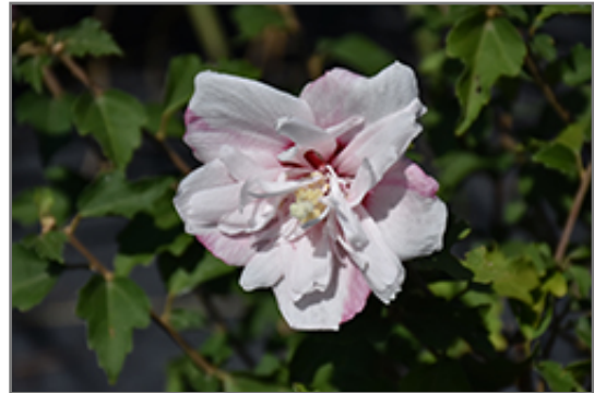
Strawberry Smoothie Rose of Sharon flowers