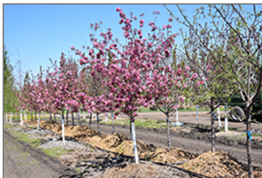
Jan Kuperus Flowering Crab in bloom