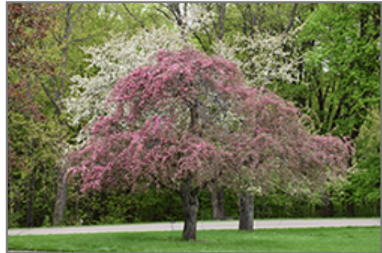
Echtermeyer Weeping Crab Apple in bloom

This shrub will require occasional maintenance and upkeep, and is best pruned in late winter once the threat of extreme cold has passed. It is a good choice for attracting birds to your yard. Gardeners should be aware of the following characteristic(s) that may warrant special consideration;