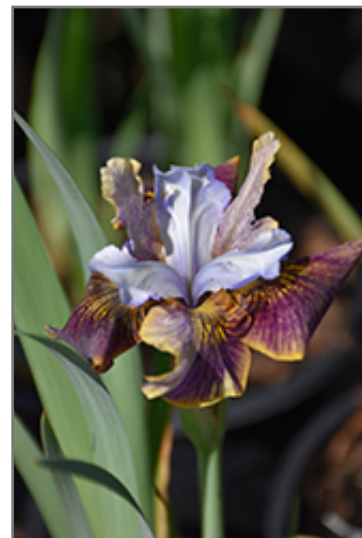
Black Joker Siberian Iris flowers

Black Joker Siberian Iris will grow to be about 18 inches tall at maturity, with a spread of 20 inches. When grown in masses or used as a bedding plant, individual plants should be spaced approximately 18 inches apart. It grows at a medium rate, and under ideal conditions can be expected to live for approximately 10 years. As an herbaceous perennial, this plant will usually die back to the crown each winter, and will regrow from the base each spring. Be careful not to disturb the crown in late winter when it may not be readily seen!