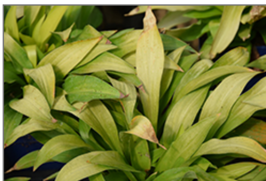
Munchkin Fire Hosta foliage