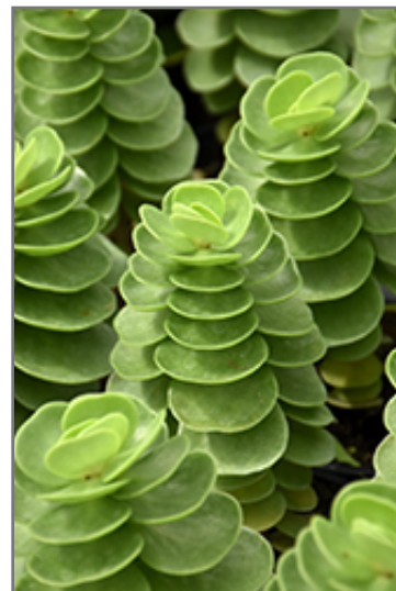
Ihi Portulaca foliage

Ihi Portulaca is recommended for the following landscape applications;