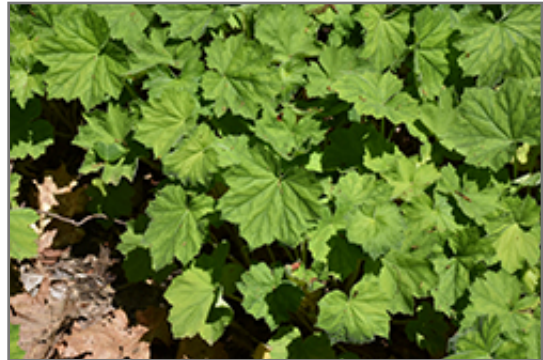
Hairy Alumroot foliage