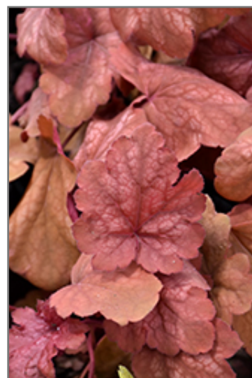
Heureka Amber Lady Bells foliage