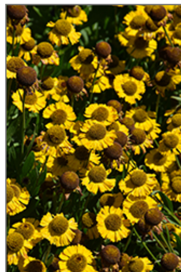
Salud Golden Sneezeweed flowers

Salud Golden Sneezeweed is recommended for the following landscape applications;