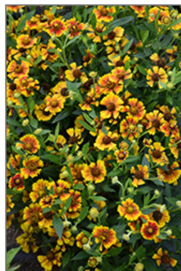
Salud Embers Sneezeweed flowers