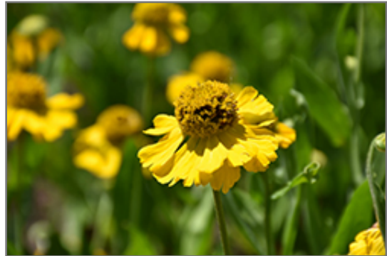
Pumilum Magnificum Sneezeweed flowers

Pumilum Magnificum Sneezeweed is recommended for the following landscape applications;