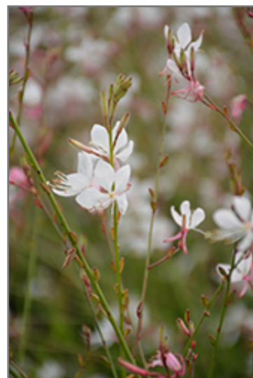
Summer Breeze Gaura flowers

Summer Breeze Gaura is recommended for the following landscape applications;