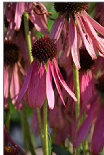
Rocket Man Coneflower flowers