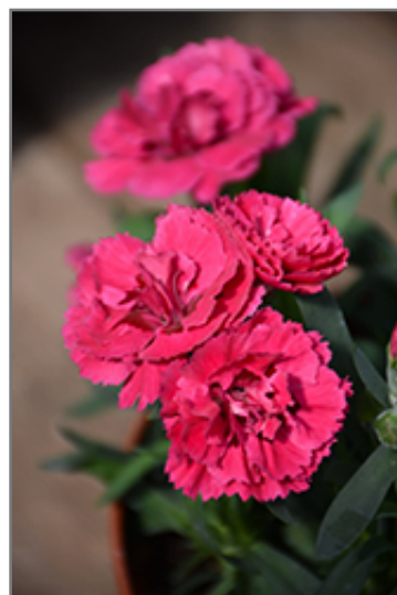
Oscar Cherry and Velvet Carnation flowers