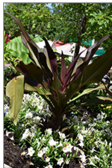
Queen Emma Giant Spider Lily foliage