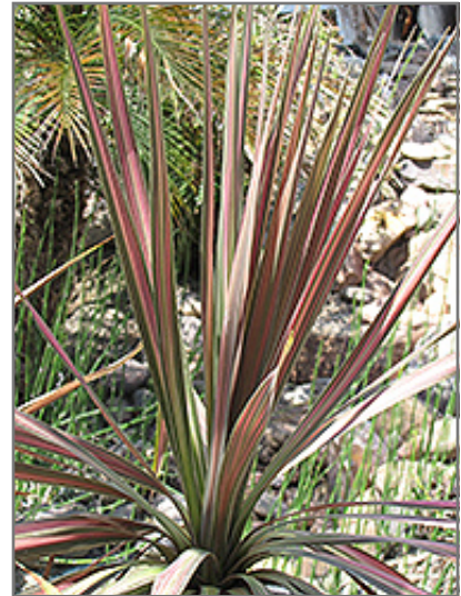
Pink Stripe Cabbage Palm