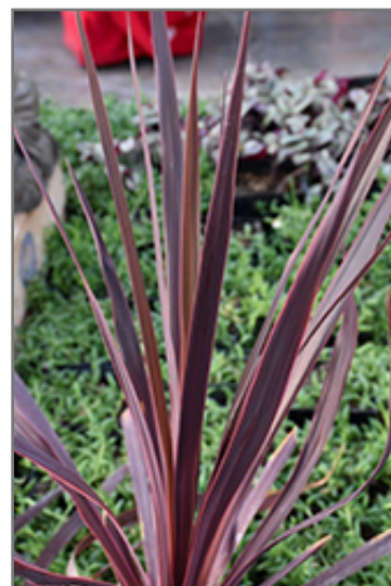
Black Knight Grass Palm foliage