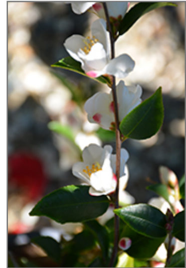
Mt. Noko Camellia flowers

Mt. Noko Camellia is recommended for the following landscape applications;