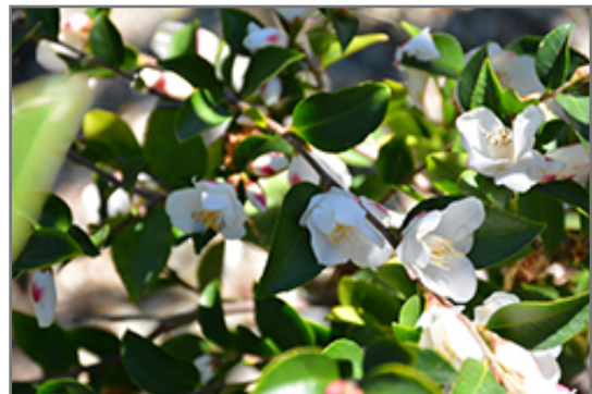
Mt. Noko Camellia flowers