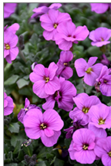
Axcent Antique Rose Rock Cress flowers