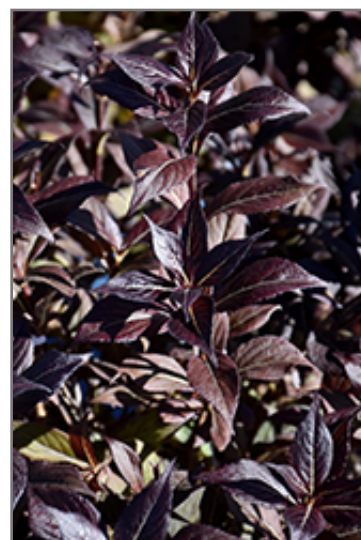
Date Night Stunner Weigela foliage