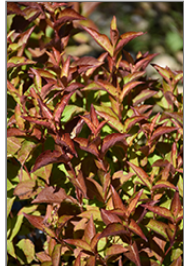
Date Night Strobe Weigela foliage