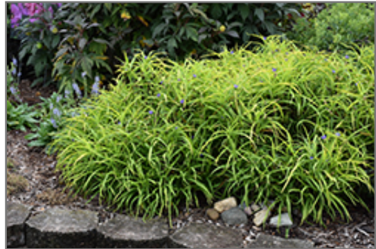
Charlotte's Web Spiderwort

Charlotte's Web Spiderwort will grow to be about 18 inches tall at maturity, with a spread of 28 inches. When grown in masses or used as a bedding plant, individual plants should be spaced approximately 24 inches apart. It grows at a fast rate, and under ideal conditions can be expected to live for approximately 10 years. As an herbaceous perennial, this plant will usually die back to the crown each winter, and will regrow from the base each spring. Be careful not to disturb the crown in late winter when it may not be readily seen! As this plant tends to go dormant in summer, it is best interplanted with late-season bloomers to hide the dying foliage.