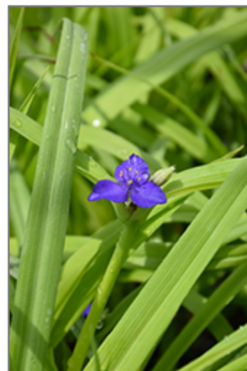
Charlotte's Web Spiderwort flowers

Charlotte's Web Spiderwort is recommended for the following landscape applications;