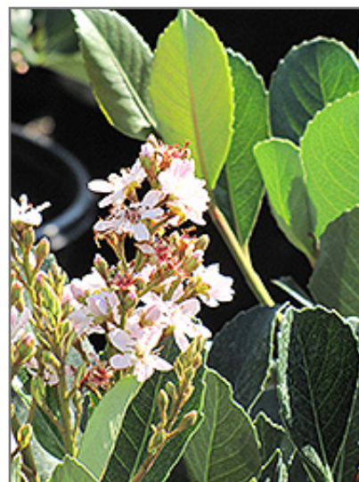
Magnificent Indian Hawthorn flowers

Magnificent Indian Hawthorn is recommended for the following landscape applications;