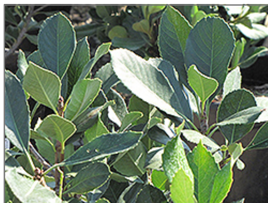
Magnificent Indian Hawthorn foliage