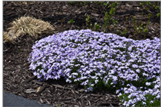
Spring Blue Moss Phlox in bloom

Spring Blue Moss Phlox is recommended for the following landscape applications;