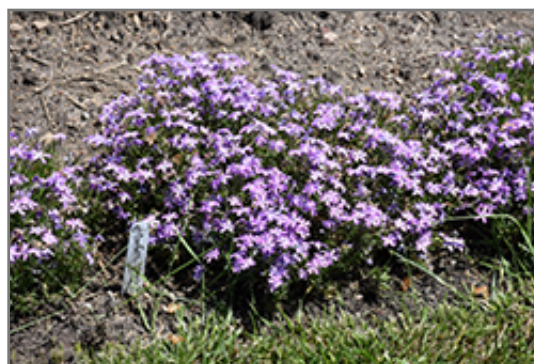
Confetti Orchid Moss Phlox in bloom