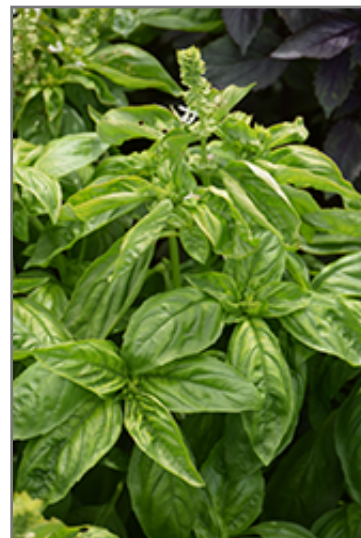
Genovese Basil foliage

Genovese Basil will grow to be about 20 inches tall at maturity, with a spread of 14 inches. When grown in masses or used as a bedding plant, individual plants should be spaced approximately 12 inches apart. This fast-growing annual will normally live for one full growing season, needing replacement the following year.