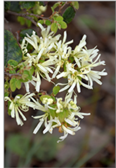
Snow Muffin Chinese Fringeflower flowers