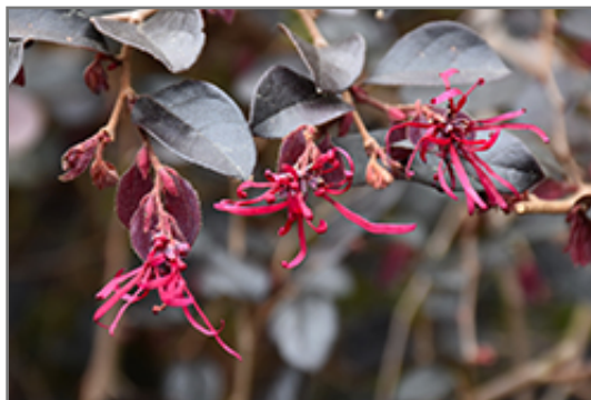
Garnet Fire Fringeflower flowers

Garnet Fire Fringeflower is recommended for the following landscape applications;