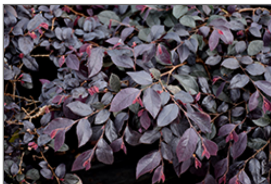
Garnet Fire Fringeflower foliage