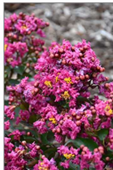
Barista Spiced Plum Crapemyrtle flowers

Barista Spiced Plum Crapemyrtle is recommended for the following landscape applications;