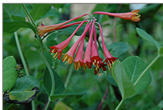
Alabama Scarlet Trumpet Honeysuckle flowers