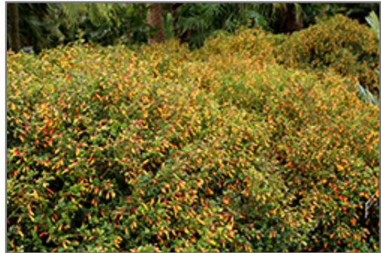
Firecracker Flower in bloom

This shrub performs well in both full sun and full shade. It prefers to grow in average to moist conditions, and shouldn't be allowed to dry out. It is not particular as to soil pH, but grows best in rich soils. It is somewhat tolerant of urban pollution. This species is not originally from North America. It can be propagated by cuttings.