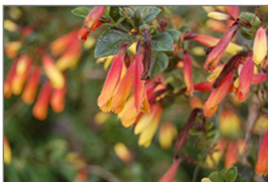
Firecracker Flower flowers