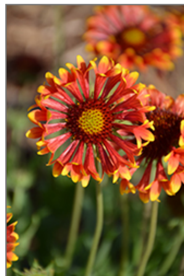
Galya Corneto Blaze Blanket Flower flowers

Galya Corneto Blaze Blanket Flower is recommended for the following landscape applications;