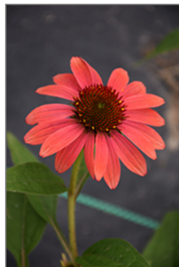
Moodz Sympathy Coneflower flowers