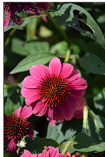
Moodz Sympathy Coneflower flowers