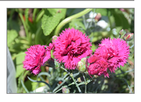
Fruit Punch Spiked Punch Pinks flowers