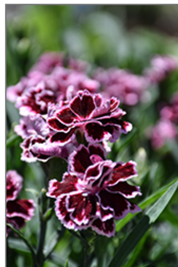
Odessa Pierrot Pinks flowers

Odessa Pierrot Pinks is recommended for the following landscape applications;