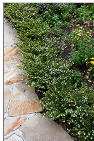
FloriGlory Maria Mexican Heather flowers