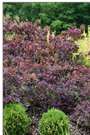
Velveteeny Purple Smokebush