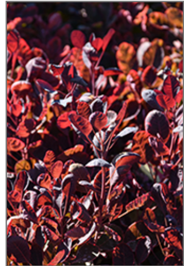
Velveteeny Purple Smokebush foliage

This plant is not reliably hardy in our region, and certain restrictions may apply; contact the store for more information.