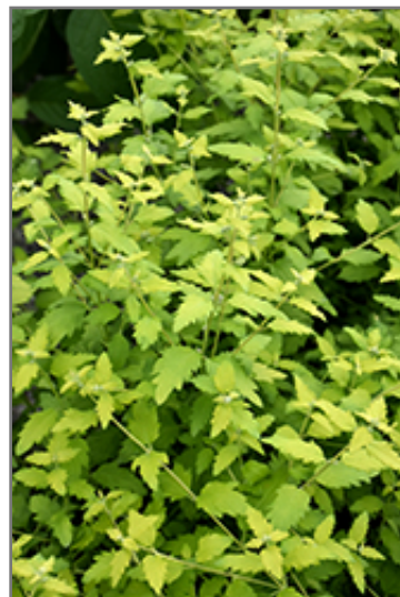
Sunshine Blue II Caryopteris foliage

This plant is not reliably hardy in our region, and certain restrictions may apply; contact the store for more information.