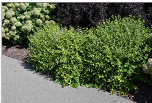
Sunshine Blue II Caryopteris in bloom