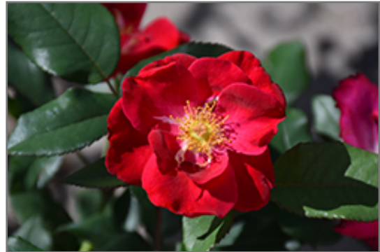
Top Gun Rose flowers

Top Gun Rose will grow to be about 4 feet tall at maturity, with a spread of 5 feet. It tends to fill out right to the ground and therefore doesn't necessarily require facer plants in front. It grows at a fast rate, and under ideal conditions can be expected to live for approximately 30 years.