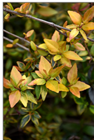
Gold Dust Abelia foliage