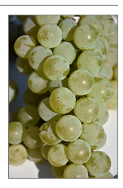
Louise Swenson Grape fruit